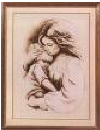
Happy Mother's Day